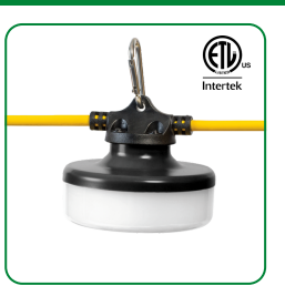
LED CordLights 15,000 Lumens P/Ns 16140 & 16145